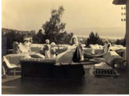
06. Airing blankets and mattresses in the sanatorium «Lebendige Kraft» (1920s)