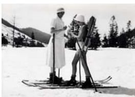
10. A nurse giving a strengthening drink of Ovaltine to a pupil at the open-air school in Leysin. About 1940.