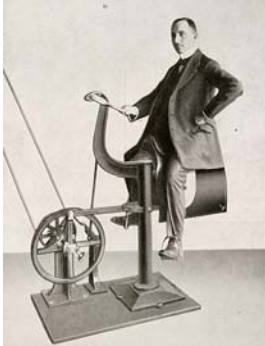
23. Apparatus for vibration in a riding position. Brochure of the company Rossel, Schwarz & Co, Wiesbaden, 1925. Medical-historical Museum of the University of Zurich.