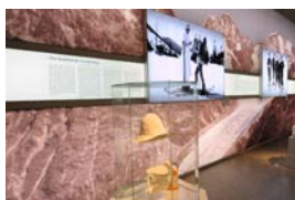
30. View into the exhibiton «Zauber Berge»