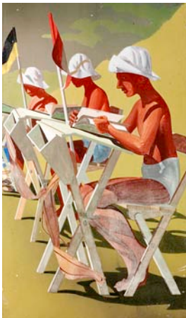
09. Heliotherapy in Leysin. Section from the monumental mural «Switzerland, holiday country of the nations» by Hans Erni for the 1939 national exhibition. ©Hans Erni, Eggen, 6006 Lucerne.