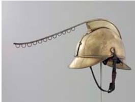
24. Elias helmet. A fireman's helmet of about 1880 was adapted to become a weight helmet, used for strengthening the muscles of the neck. Sportmuseum Schweiz, Basel.