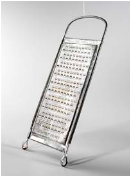
08. Original Bircher grater. About 1940. Swiss National Museum.