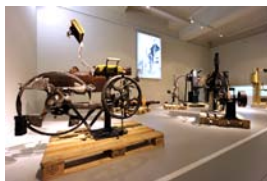
29. View into the exhibiton «Zauber Berge»