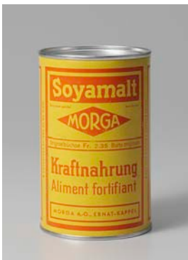
27. Soyamalt breakfast drink, 1935. Morga AG, Ebnat-Kappel.