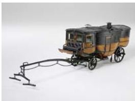
26. Model of a carriage for transporting patients from Berne to Schinznach-Bad. Georges Müller, Berne, 1829. Inselspital-Stiftung, Berne.