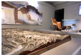
28. View into the exhibiton «Zauber Berge»