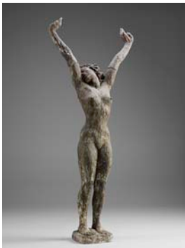
25. Plaster original for the monumental sculpture «Girl with raised arms» by Hermann Haller for the National Exhibition. 1939. Hermann Haller's studio.