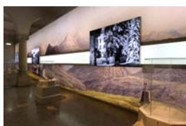
31. View into the exhibiton «Zauber Berge»

All illustrations are available for download from the «Press» section of our homepage www.zauberberge.landmuseum.ch